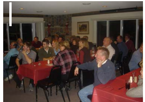
Full house for the fun evening!